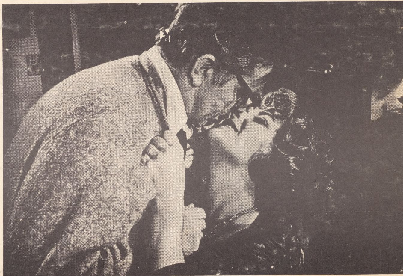
RICHARD BURTON & ELIZABETH TAYLOR